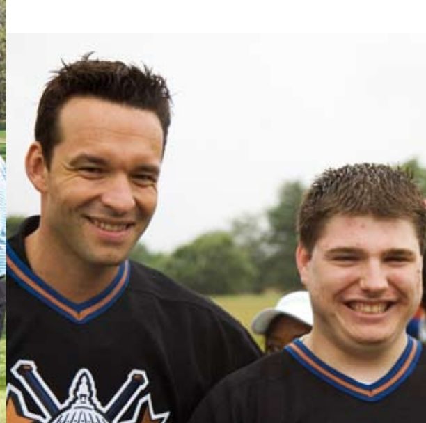
Olie Kolzig celebrates KEEN's Sports Festival with an athlete who is a fan!