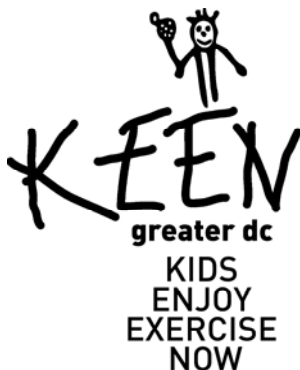
Greater DC vertical logo

This new look was unveiled in our new brochure, which, if you haven't seen it, can be viewed on our website. Oh, did I mention we have a new website as well? The new logo had to be incorporated into our design, as did the new colors introduced in the brochure. And our web address has changed. You can now find everything you need to know at www.keengreaterdc.org . So change your bookmarks! However, if you forget, you can still go to www.keenusa.org and link to Greater DC. While you're there, visit our new affiliates' sites, and see what they are up to. And don't forget to visit our three sister sites in England. It is quite humorous to see some of the changes to Ken across the pond!