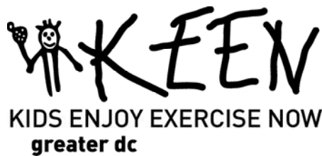
Greater DC horizontal logo

All of these changes have come about as a result of KEEN's growth from a single location here in the Washington, DC area to a national organization with affiliates in Chicago, Kansas City, and yes – Greater DC. So we have been working to give each affiliate, plus the national umbrella, its own variation of our logo. For help, we turned to the Bates Creative Group (recognized for their efforts at this year's KEENFest). They designed two new logos for us, one horizontal, one vertical. They also designed the new masthead for this newsletter.